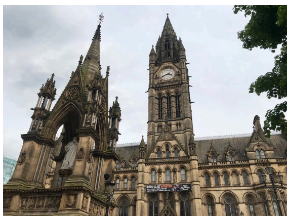
Manchester Town Hall

I arrived at Manchester on 25 th January as the orientation is held on 26 th . 25 th was a busy day because I needed to settle down all the stuff in dormitory. During the orientation activity, I met a lot of exchange students coming from different parts of the globe. There was also a walking tour which the local students guided us to have a walk around the campus and introduced the school buildings and facilities. Semester started from 31 st Jan. Thus, I had four free days after orientation to explore the Manchester city. Arndale is one of the biggest shopping malls in the city centers and I could get whatever I needed there. Everything here was new to me and I was looking forward to studying in Manchester.